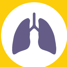
Rapid, shallow breathing