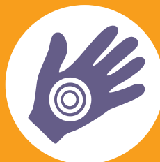
Warm, flushed skin